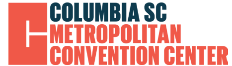
Exhibit Space Rates

Friday 2pm - 7pm Saturday 10am - 7pm Sunday 11am - 5pm