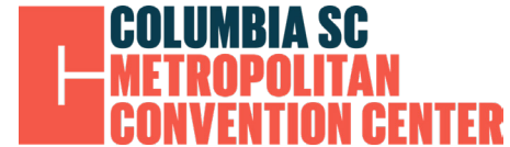
Exhibit Space Rates

Friday 2pm - 7pm Saturday 10am - 7pm Sunday 11am - 5pm