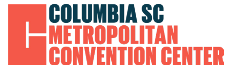
Exhibit Space Rates

Friday 2pm - 7pm Saturday 10am - 7pm Sunday 11am - 5pm