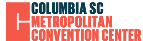
Exhibit Space Rates

Friday 2pm - 7pm Saturday 10am - 7pm Sunday 11am - 5pm