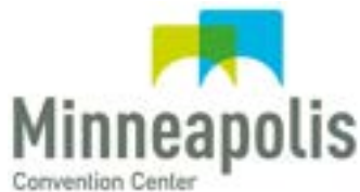
Exhibit Space Rates