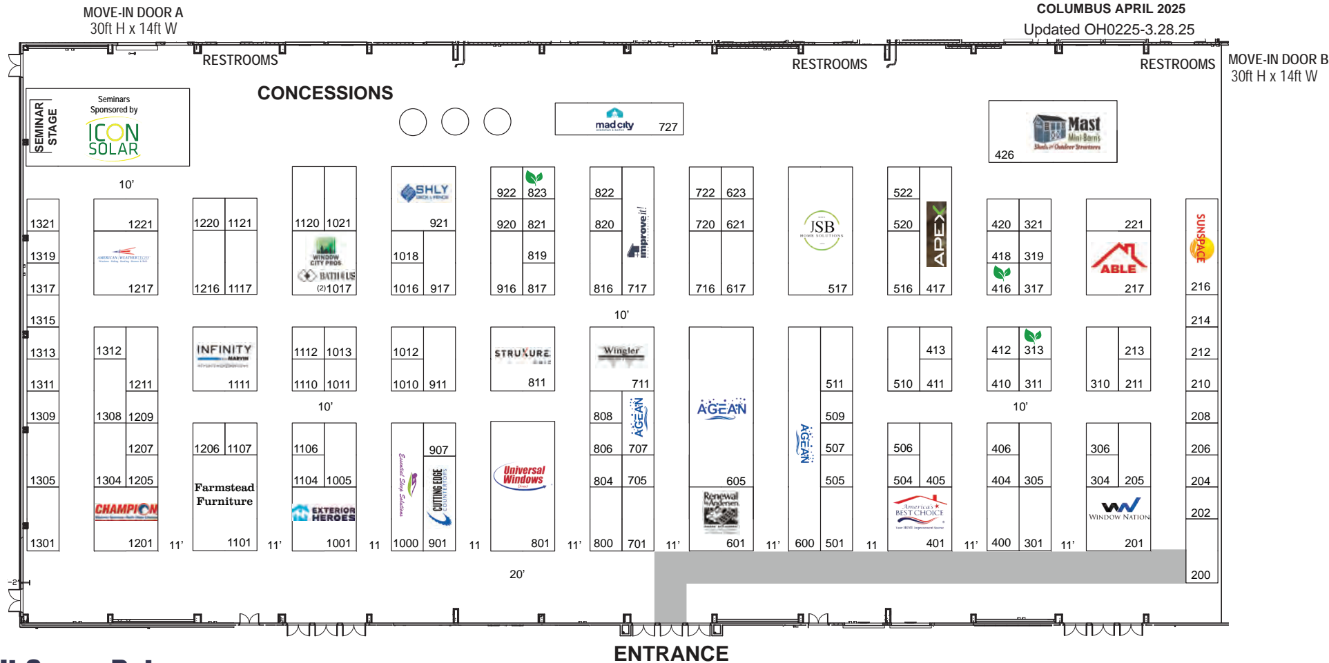
Exhibit Space Rates