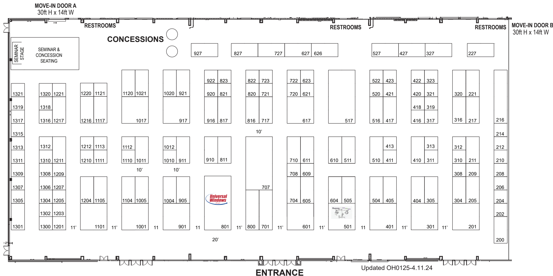
Exhibit Space Rates