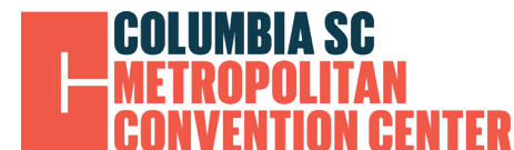
Exhibit Space Rates

Friday 2pm - 7pm Saturday 10am - 7pm Sunday 11am - 5pm