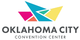
Exhibit Hall A 500 S. Robinson Oklahoma City, OK 73109 okcconventioncenter.com