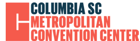
Exhibit Space Rates

Friday 2pm - 7pm Saturday 10am - 7pm Sunday 11am - 5pm