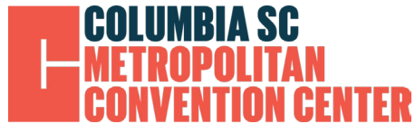
Exhibit Space Rates

Friday 2pm - 7pm Saturday 10am - 7pm Sunday 11am - 5pm