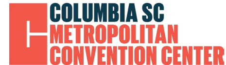
Exhibit Space Rates

Friday 2pm - 7pm Saturday 10am - 7pm Sunday 11am - 5pm