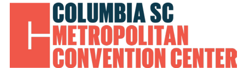
Exhibit Space Rates

Friday 2pm - 7pm Saturday 10am - 7pm Sunday 11am - 5pm