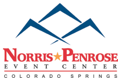
Exhibit Space Rates

Multi-show discounts available. Ask your show manager.