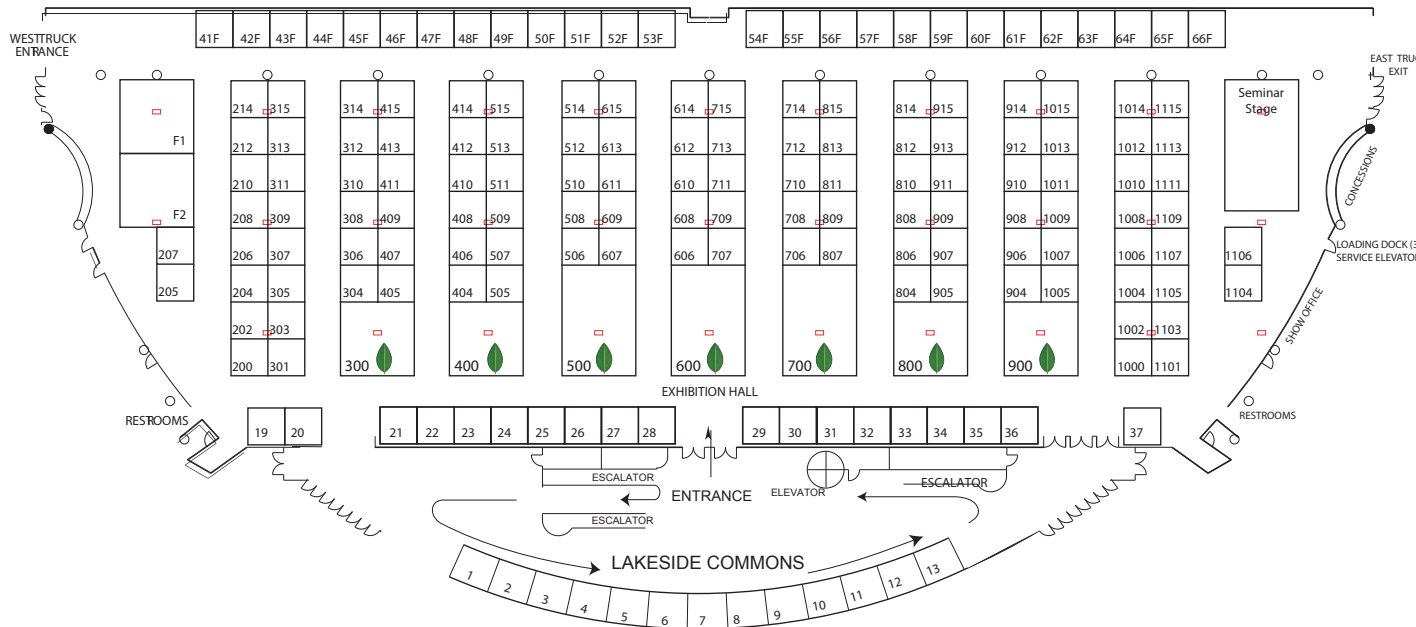
Exhibit Space Rates

BOOTHS #41 - #66 MUST MOVE-IN ON FRIDAY MORNING AND MOVE-OUT ON SUNDAY NIGHT