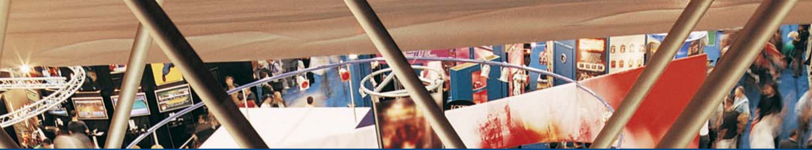
Exhibit Services Reliable trade show shipping services