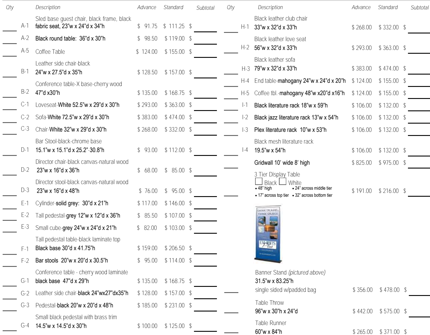
Exhibit Plus Custom Furniture Options

Advance Order Discount Deadline: January 3, 2020