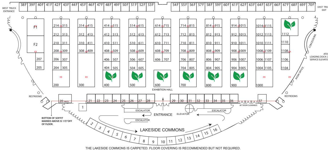
Exhibit Space Rates

BOOTHS #38 - #70 MUST MOVE-IN ON FRIDAY MORNING AND MOVE-OUT ON SUNDAY NIGHT