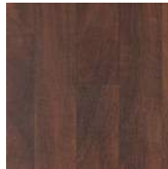
Brazilian Walnut (BW)