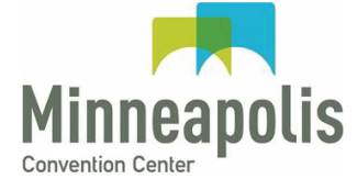
Exhibit Space Rates

Multi-show discounts available. Ask your show manager.